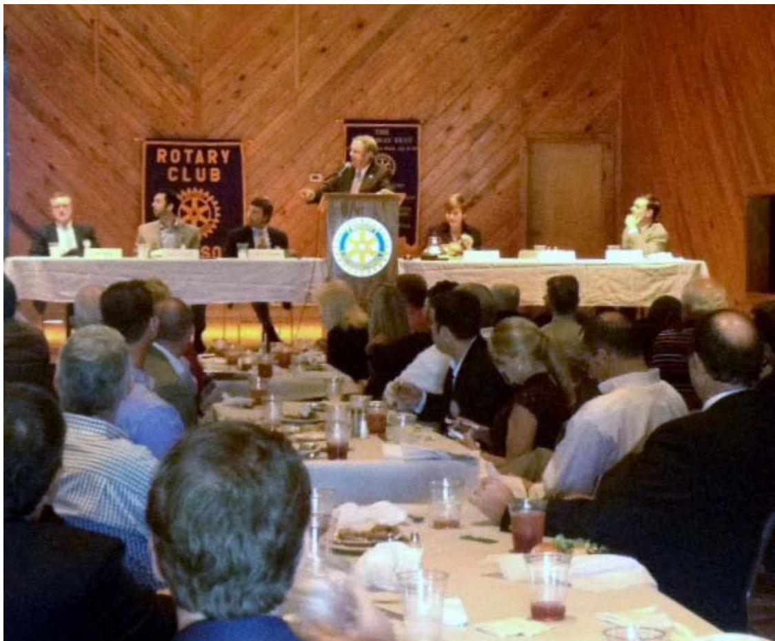
COMMISSIONER SPEAKS TO OVER 200 JACKSON ROTARY MEMBERS ABOUT INSURANCE ISSUES.

SPECIAL NOTE: The 2013 MID Medicare Supplement Shopper's Guide is now available on the Mississippi Insurance Department