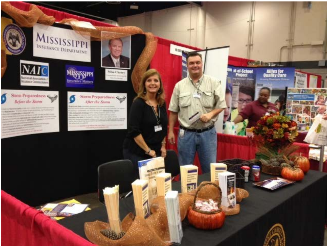
Consumer Services Representatives were on hand to assist consumers at this year's Mississippi State Fair, October 2-13, 2013.